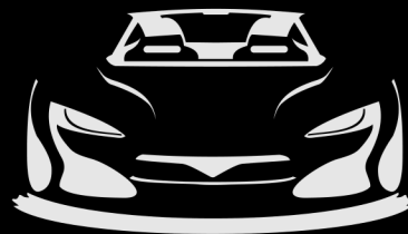
HIGH PERFORMANCE VEHICLES

Apex Financial Services is a Licenced Financial Service Provider